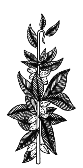
Vol. 1, Nos. 49, 50