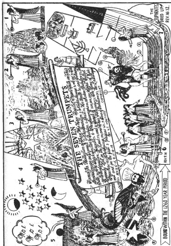
"How Long Halt Ye Between Two Opinions?"